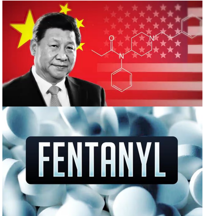
TCCR Social Media Screenshots

Shortly after the Korean Armistice was signed on July 27, 1953, we believe that the Chinese Communist Party (CCP) reached the conclusion that a military engagement with the United States would not achieve their revolutionary goals. Reaching back to China's ancient past, the CCP embraced the idea that Sun Tzu (544-496 BC) expressed about warfare. "The supreme act of war is to subdue the enemy without fighting."