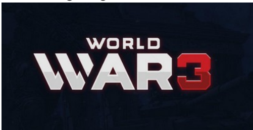
TCCR Social Media Screenshots

A "Covert War" began. Over time, that war has expanded into a world war with many fronts. Open the video for the report on the new "Opium Wars" that China has fostered upon the world and particularly the United States.